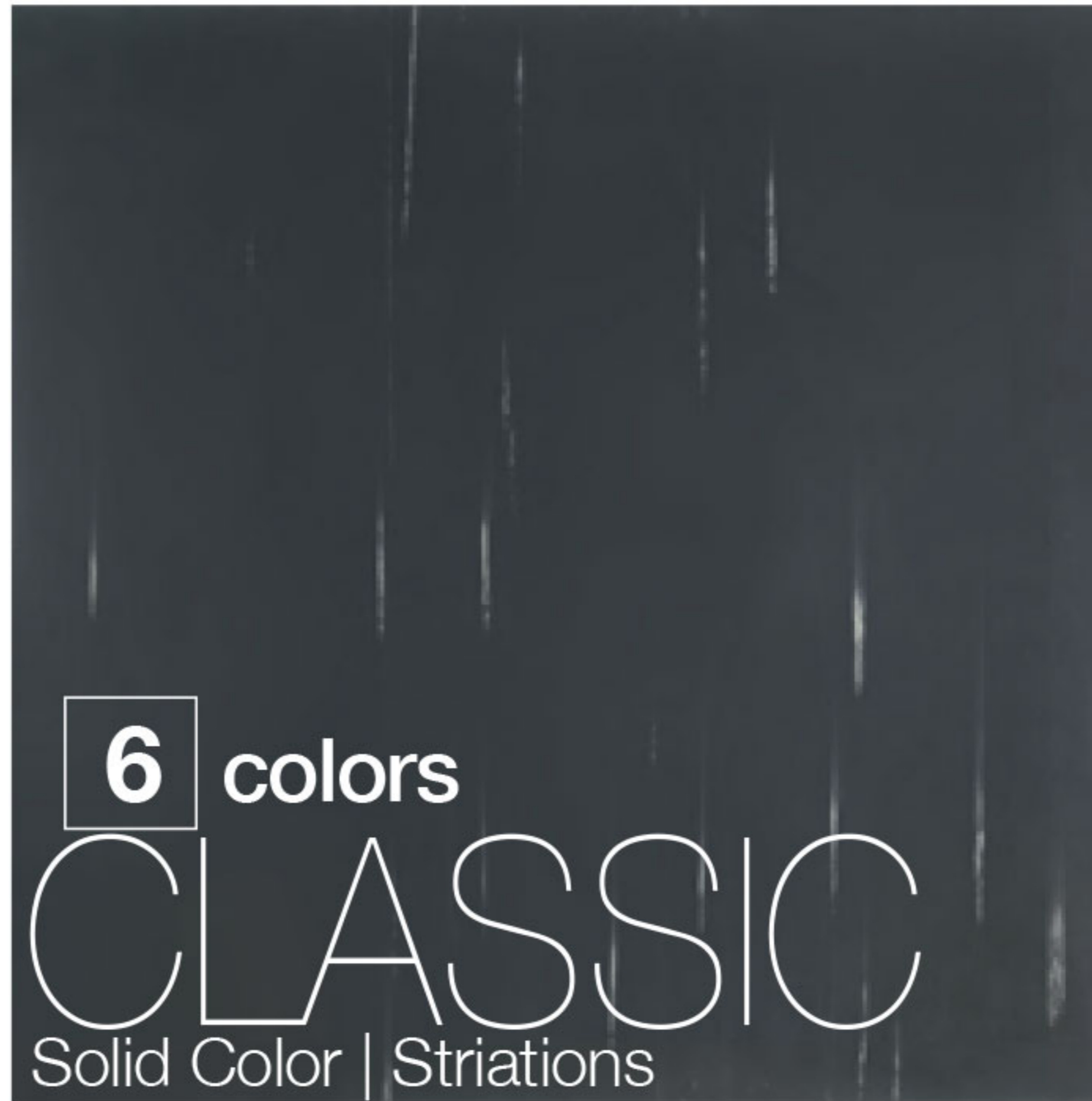
0084 | Light Black