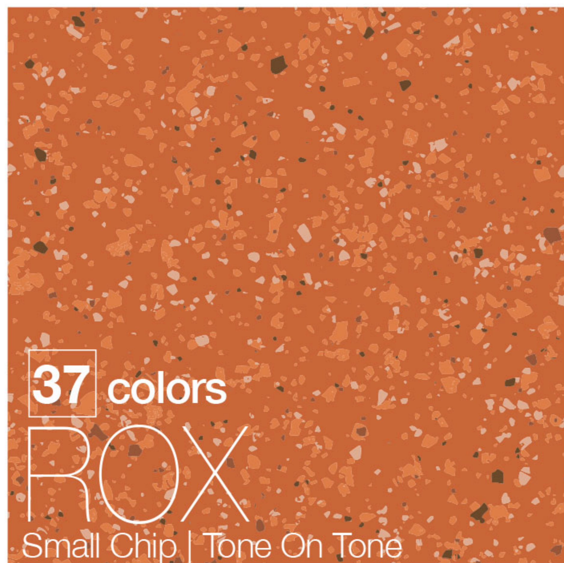
6652 | Tex-Mex