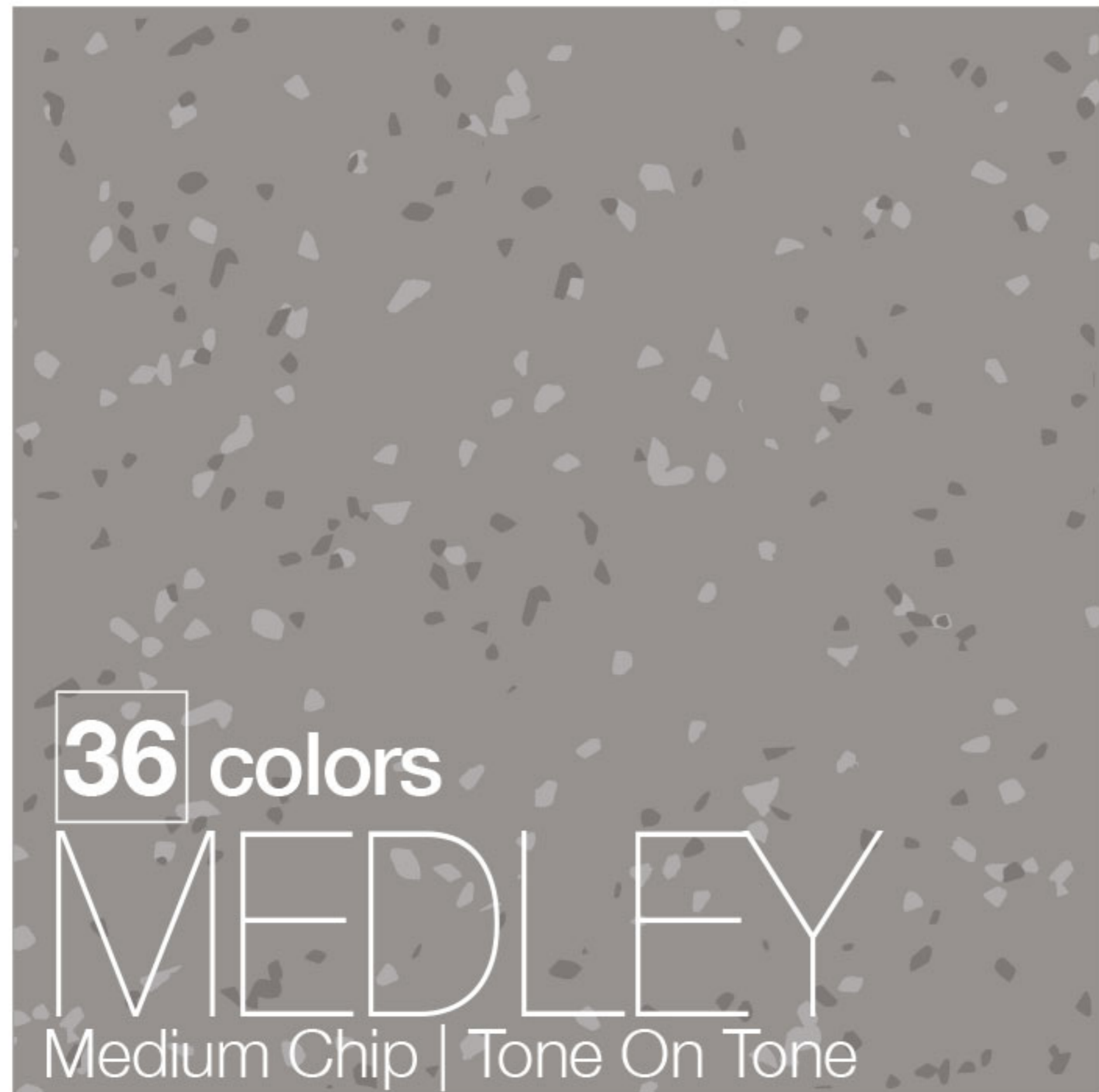
8804 | Tribeca