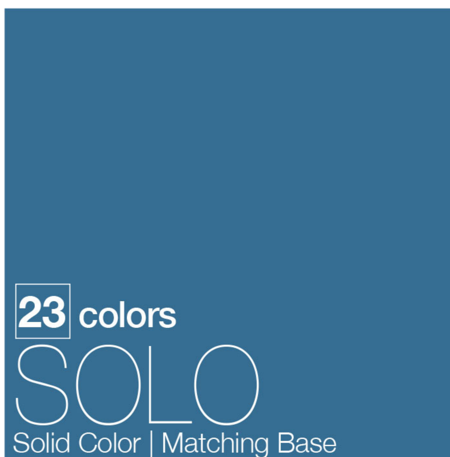
0036 | Steel Blue