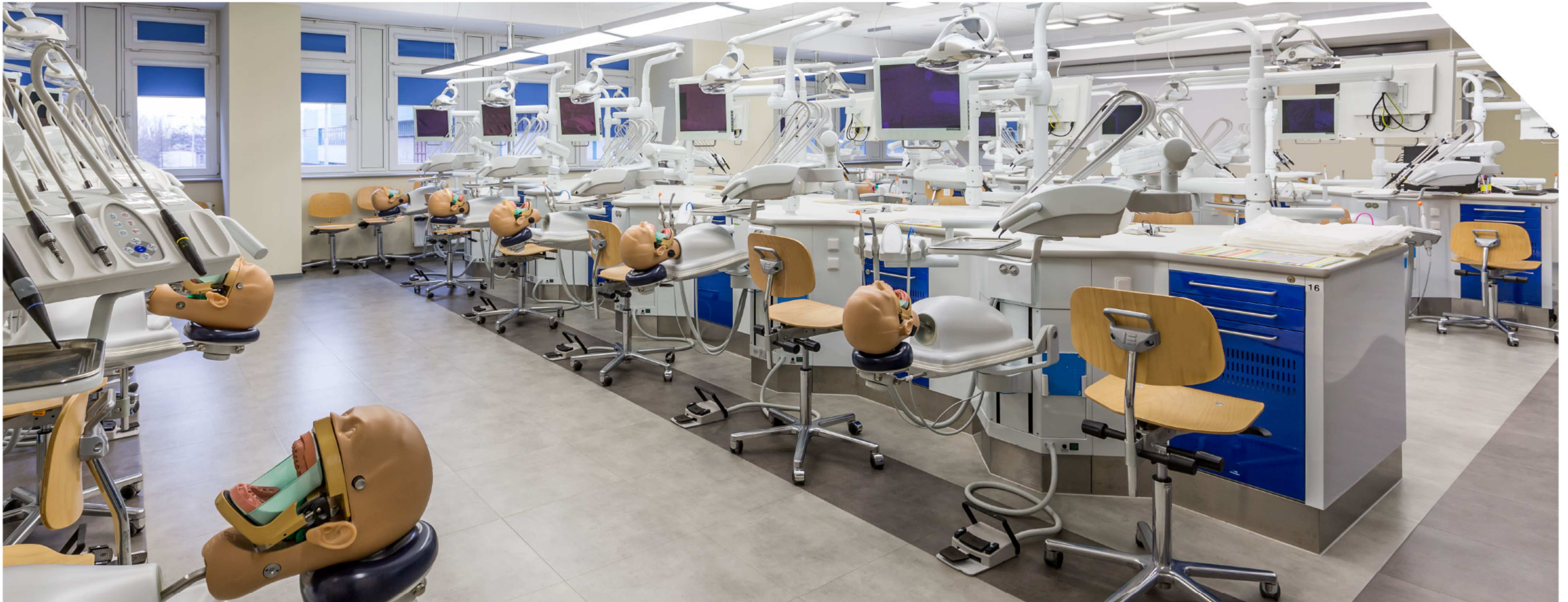
view technical data & specifications at rikett.net